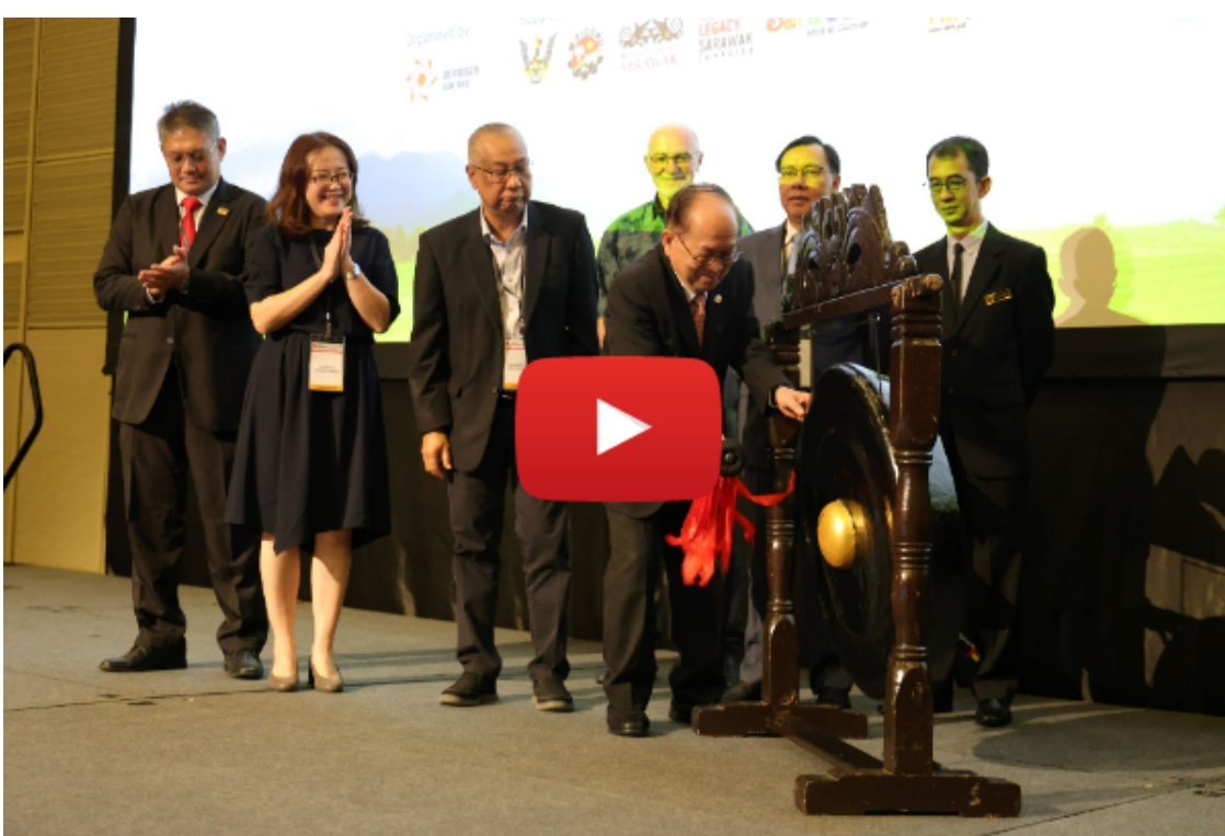
SATCE Day 1 Show Highlights