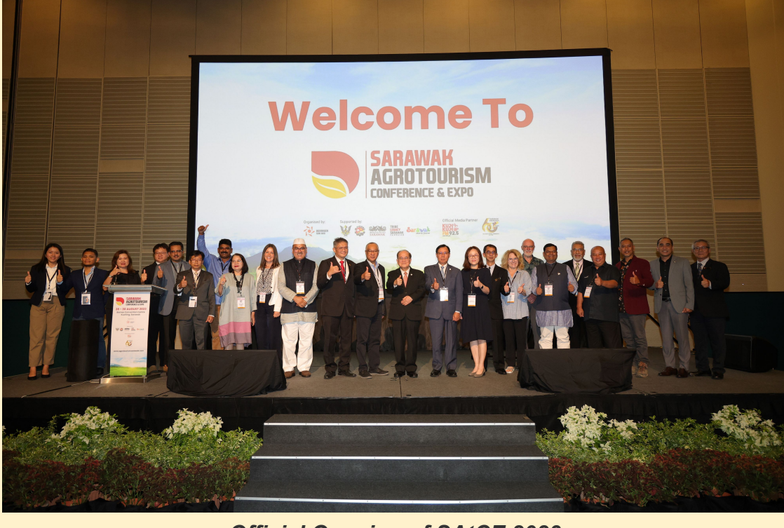
Official Opening of SATCE 2023

Experience the enchantment of SATCE 2023, where Sarawak's rich heritage and agrotourism potential came to life in a captivating traditional dance. YB Datuk Amar Douglas Uggah Embas, representing the Premier of Sarawak, YAB Datuk Patinggi Tan Sri Abang Johari Openg, ignited the event with a vision of agrotourism as a magnet for high-value tourists, uniting agriculture with eco-adventures and empowering local communities. This holistic approach not only promises economic growth but also safeguards Sarawak's cultural legacy.